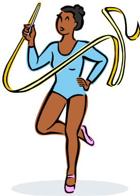
Throw and Relay.

Through Dance, girls will learn to develop body management, to express and communicate ideas through a range of dance vocabulary using a variety of stimuli such as poetry, music, sounds, artefacts and celebrations; to choreograph dance sequences; to develop a good movement memory and acquire an appreciation of dance.