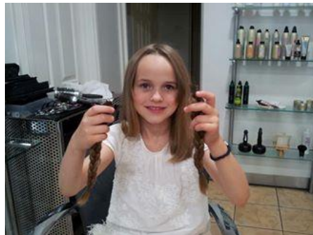
.....and after her haircut.

The Little Princess Trust provides real hair wigs, free of charge across the UK and Ireland, to children who have sadly lost their own hair due to cancer treatment and other illnesses. To make a hair donation you need to provide a plait of at least 7 inches with an inch at either End. It can take quite a long time to grow but it is so gratifying to feel that you can make a difference to another child, especially when it is such a simple thing to do. (guidelines and permission slip are on the site) www.littleprincesses.org.uk/