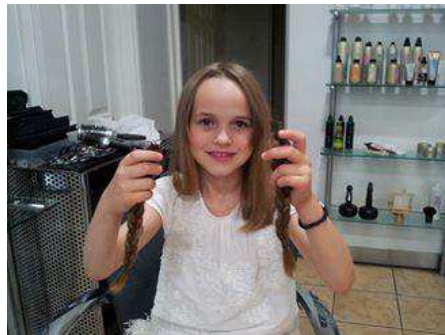
.....and after her haircut.

The Little Princess Trust provides real hair wigs, free of charge across the UK and Ireland, to children who have sadly lost their own hair due to cancer treatment and other illnesses. To make a hair donation you need to provide a plait of at least 7 inches with an inch at either End. It can take quite a long time to grow but it is so gratifying to feel that you can make a difference to another child, especially when it is such a simple thing to do. (guidelines and permission slip are on the site) www.littleprincesses.org.uk/