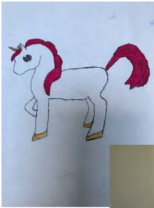
Daisy (FIV) has been getting creative this week baking and drawing.