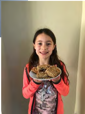
We have some more maths skills being put to good use in the kitchen this week.