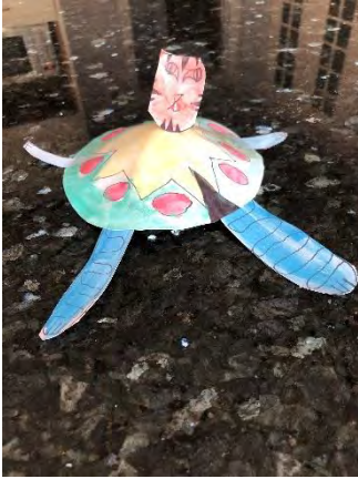
Georgia (FIII) 3D cat artwork.