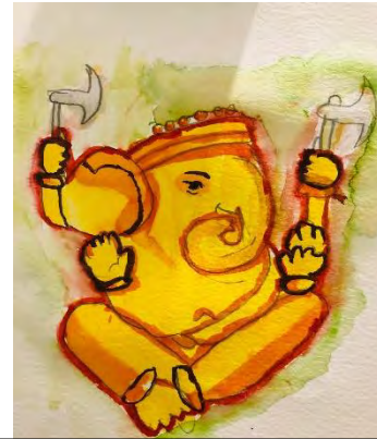
Kareena (FII) has painted a water colour of the religious God Ganesh.