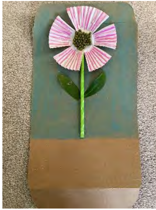
Shreya (FI) created a flower collage following her science lesson.